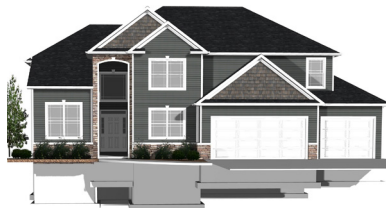
The OAK HARBOR