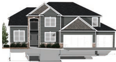
The OAK HARBOR