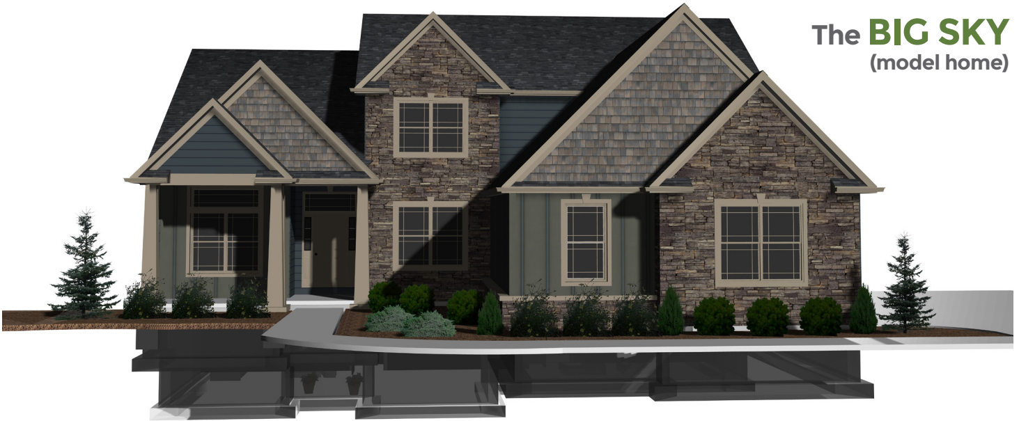
The BIG SKY (model home)