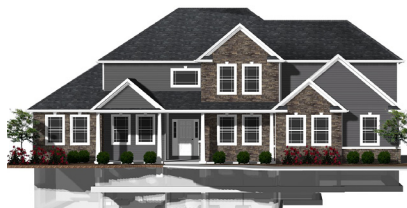
The SAN ANTONIO